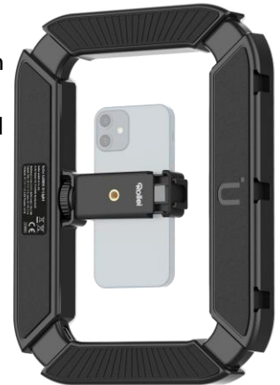
Smartphone not included.